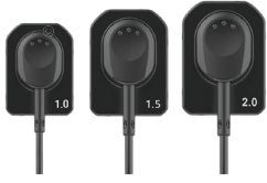
EzSensor Vet High resolution intraoral CMOS sensors