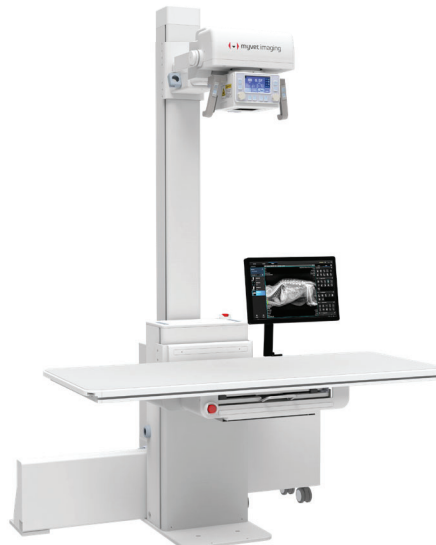
myvet table i72+ Elevating X-Ray Table System