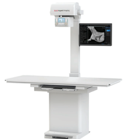
myvet table 32+ Fully Integrated X-Ray Table System