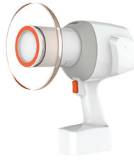
EzRay Air Vet Light-weight portable x-ray