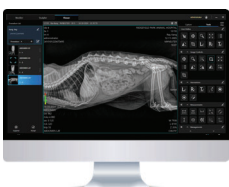
MyVet View Pro Acquisition Software