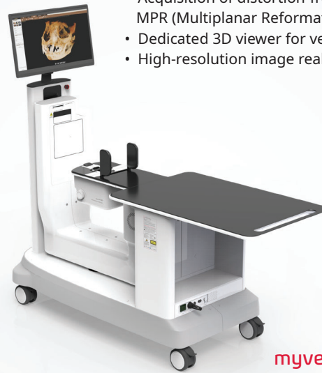
myvet CT D