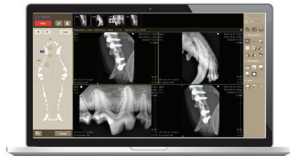
MyVet Dent Dental optimized acquisition software