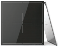
myvet 1717DR W Wireless DR panel (CsI)