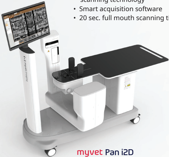
myvet Pan i2D